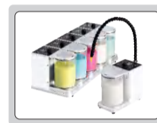
dripping system (optional)