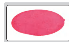
polishing cloth (included)