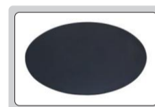
magnetic pad (included)